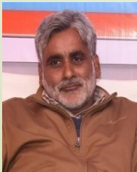
Guest of Honor