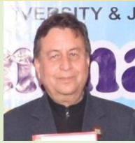
Guest of Honor